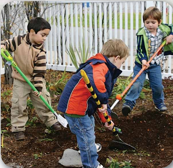
The Outdoor Classroom provides an ideal environment for children to explore the outdoors with all its possibilities for play, discovery and socializing.