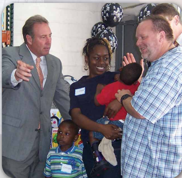
Mayor Robert Duffy and Senator Joseph Robach were on hand to thank the TIC-TOC program for the wonderful resource they have provided for children with physical or developmental disabilities

Workshop so other volunteers can develop skills and techniques to adapt toys and equipment for children with disabilities. To learn more about the Pirate Toy Fund and the TIC-TOC Program visit their web site: www.piratetoyfund.org .