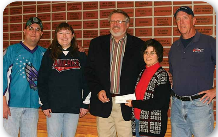
Left to Right: Need names