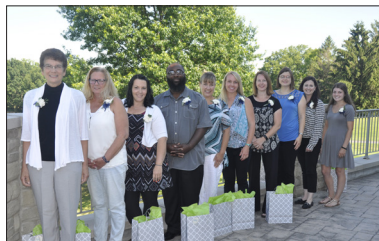
Professional Service Finalists