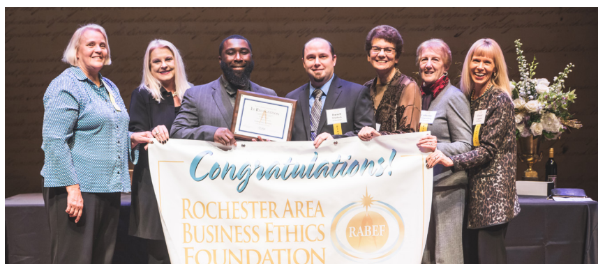
CP Rochester, a finalist for the 2018 ETHIE Award