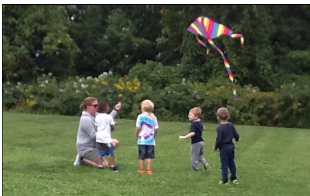
Happiness House preschoolers learn about wind and flying kites