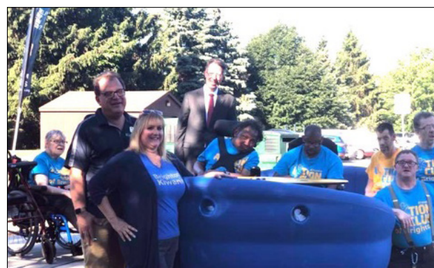
CP Rochester individuals help introduce the new swing glider at a Brighton playground