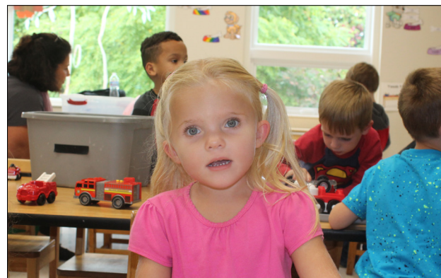
Playtime at Happiness House New Friends Preschool