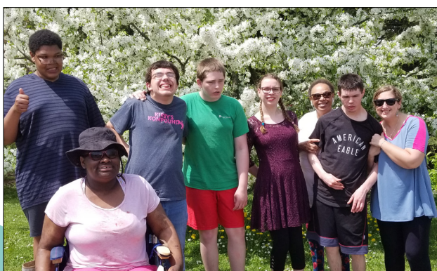
Happiness House IRA friends have fun at the Lilac Fest Fun