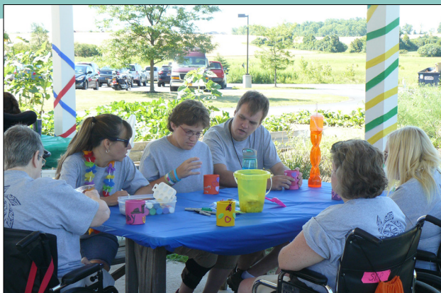
Happiness House Summer Bash