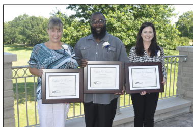
2018 John Horvath Professional Service Award Winners