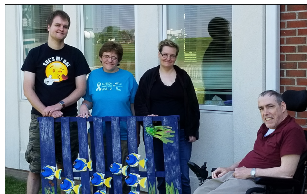
Happiness House Structured Day Program Art Group