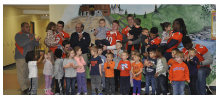
Happiness House named 2018 Best of Finger Lakes for Preschool or Daycare