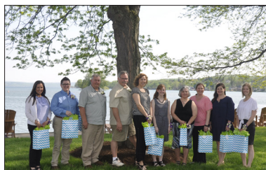
Professional Service Finalists