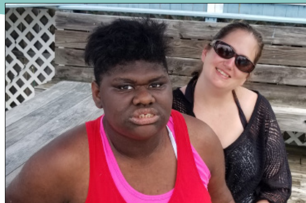
The summer camping trip was a huge success!