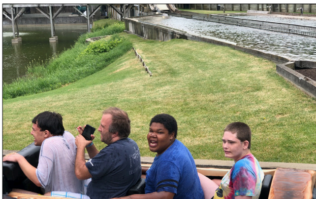
Happiness House IRA friends enjoy a day at Seabreeze Amusement Park