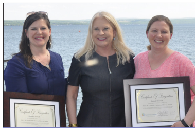
2018 Mary Griswold Professional Service Award Winners

We recognized the dedication and hard work of all CP Rochester and Happiness House Employees at two separate celebrations. Professional Service Awards and Years of Service Awards were presented.